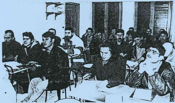
Eager students soaking up an English lesson

Please continue to pray for this strategic and effective ministry that helps meet a practical need in the name of Jesus.