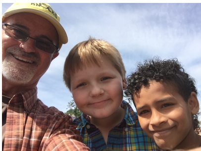
(Double click photo to enlarge) Two of my young friends who have been a big blessing to me in our mentoring