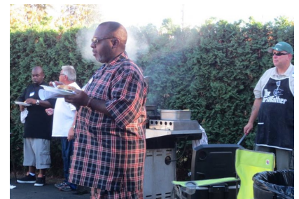
(Double click photo to enlarge) Our block party is such a great way to get to know neighbors and build relationships that