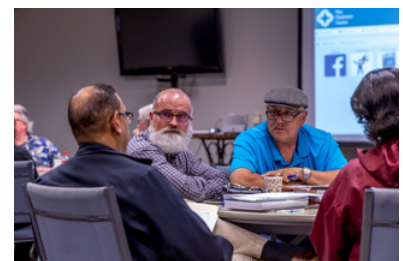
Much of the training involved small group