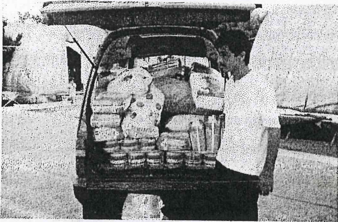
Taking supplies to the refugee camp