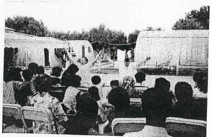
Evangelistic drama presented