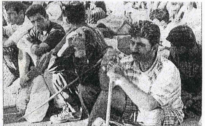
Hundreds of homeless Kurds crowded together in a downtown square