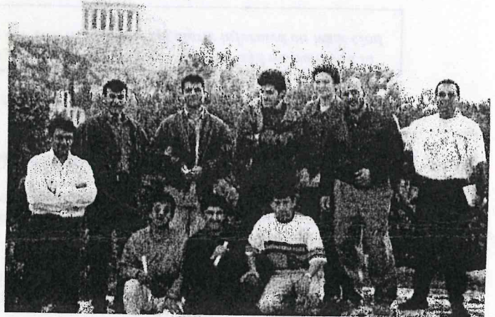
The first members of the Athens Kurdish Fellowship