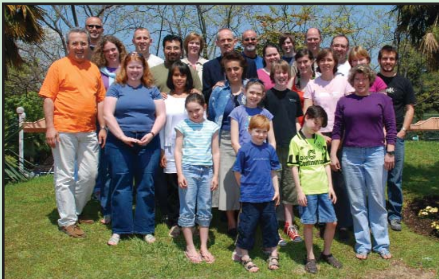
OUR ATHENS TEAM

http://refminathens.blogspot.com (some refugee stories)