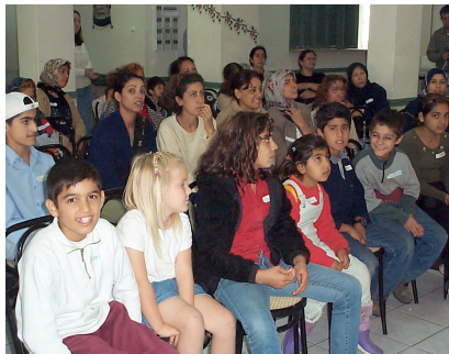
Bible story time is when lives are changed as they hear about how God gives them hope in their desperate situations.