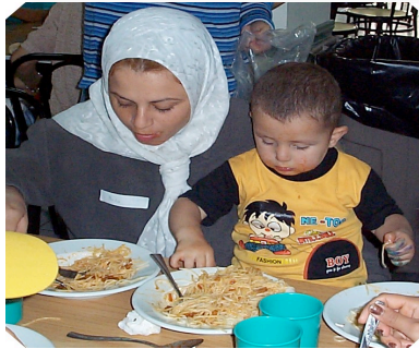
Food is always a highlight. We even found women putting spaghetti in their purses!